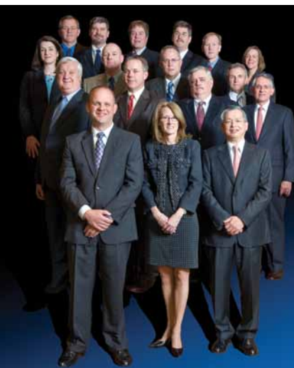
Senior Management Team

These improvements and realignment activities, in addition to the work that we have done over the last several years on rebalancing and