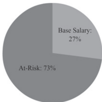
CEO Pay Mix