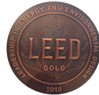
The building leased by RELX Beijing Office has received the LEED Gold certification.

We standardize the decoration of RELX stores and provide uniform publicity materials to avoid waste caused by excessive decoration and display. We advocate green consumption to users, promoting Used Pods Recycling Programs to recycle used pods. 1