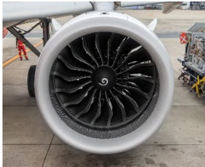
Current Narrow Body Lipskin