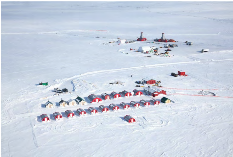
Figure 2: Aerial photos of Bob Camp (upper picture) and Kelvin Camp (lower picture)